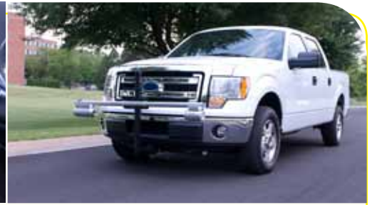
Adjustable height for safe driving speeds.