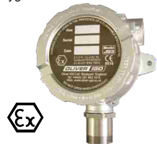
TOCSIN 102 Series Detectors Flammable Gases, Toxic Gases Oxygen For ATEX Applications