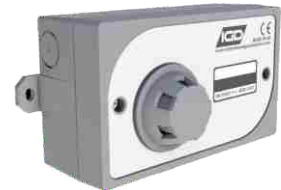
TOC-30 Series Detectors Flammable Gases, Toxic Gases Oxygen