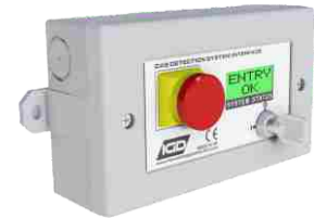
TOC-30 Series Annunciator Options With: Display, Relay Output, Digital or Analogue Input, Flammable Gas Detector