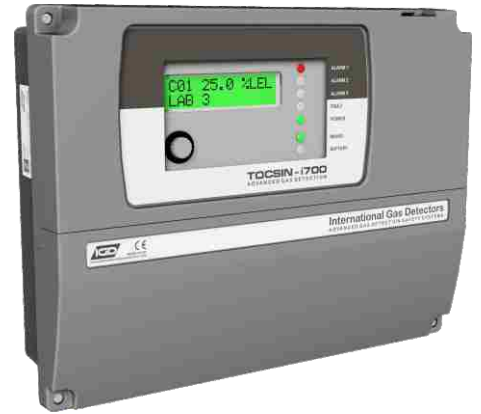
TOCSIN i700 Series Controller